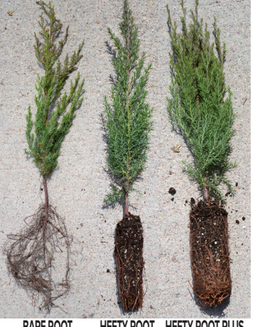
BARE ROOT HEFTY ROOT HEFTY ROOT PLUS JUNIPER JUNIPER

Root system is quicker to establish in the first year